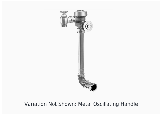
Variation Not Shown: Metal Oscillating Handle