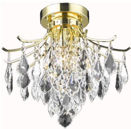
Gold Item No:LD8100F16G